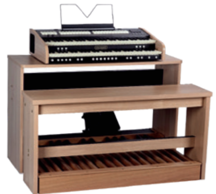
(model shown with optional large stand, bench and 30-note pedal board)